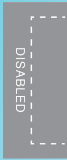
Disabled badge holders only