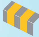
No loading at any time