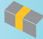
No loading at times indicated on plate