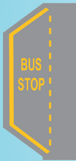
Do not stop or park at or near a Bus stop